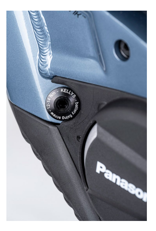
FIGURE 10: SCREW HEAD WITH PRESCRIBED TORQUE

Once properly inserted, tighten the screw to the torque indicated on the bolt head (Figure 10) in a clockwise direction.