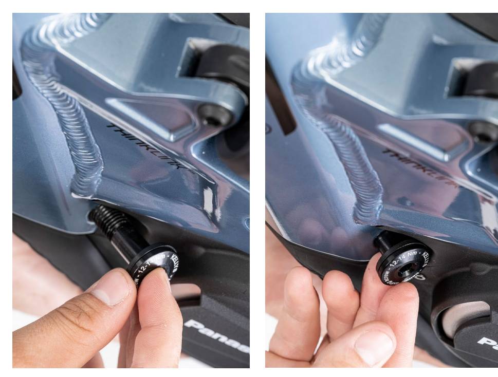
FIGURE 9: LOOSELY INSERTED SCREW IN THE FRAME

after correct embedding, the screw should be able to be inserted freely - without turning to such a depth that the thread on the screw is not visible (Figure 9). If the screw cannot be fitted in this way, it must be removed and the holes concentricity checked.