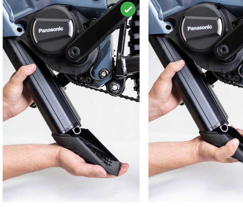
FIGURE 4: CORRECT BATTERY HOLDING

When inserting the battery, hold its body and support the lower plastic cover (Figure 4). Take care not to squeeze the lower plastic battery cover from the sides (Figure 5) - this may cause the plastic battery cover to seat incorrectly on the engine cover.