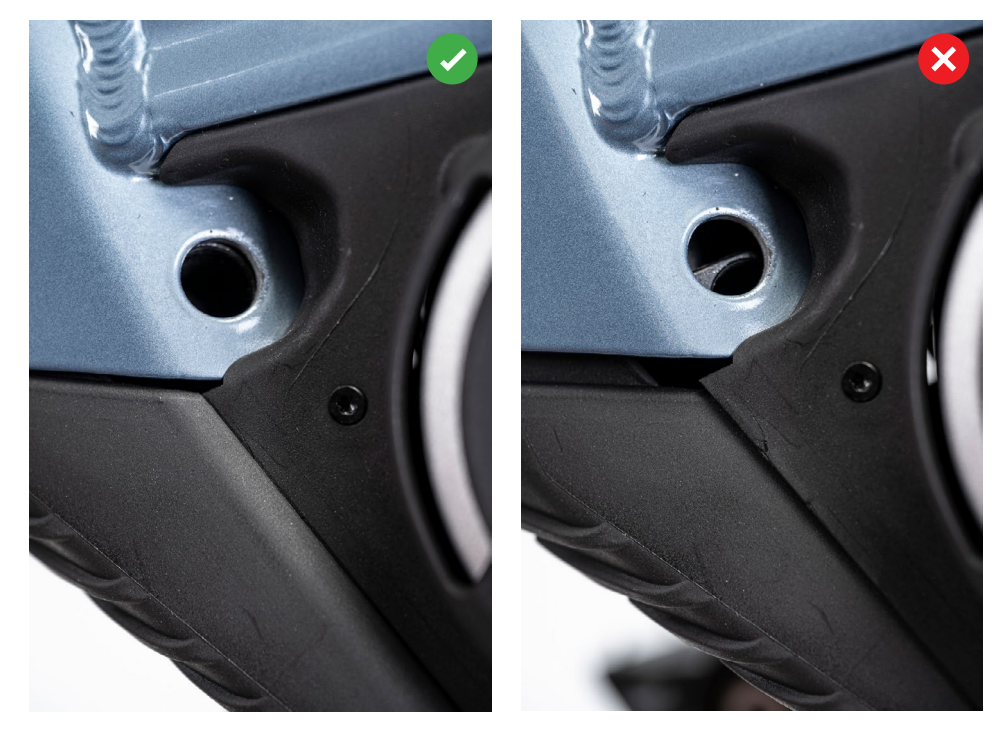
FIGURE 6: CHECK THE HOLE CONCENTRICITY IN THE FRAME AND THE BATTERIES

The hole in the frame and the hole on the battery body used for securing the screw are concentric (Figure 6). The battery cover overlaps the engine cover on both the left (non-drive side)(Figure 7) and right (drive side) (Figure 8).