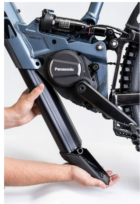
FIGURE 2: REMOVAL OF THE SCREW